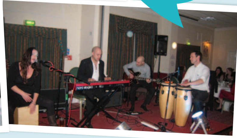
^ The Saturday evening dinner and dance in full swing