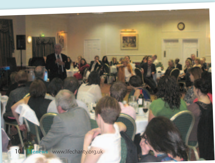
< Comedian and LIFE patron Don Maclean entertains the audience