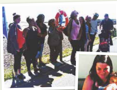
Tenants and Support Workers enjoy the sunshine on the seafront

Tenants from both Slough LIFE houses enjoyed a group Life Skills trip to the Winter Wonderland in Hyde Park, London in December.