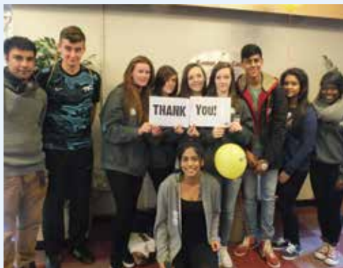
The kids and team from Challenge Network