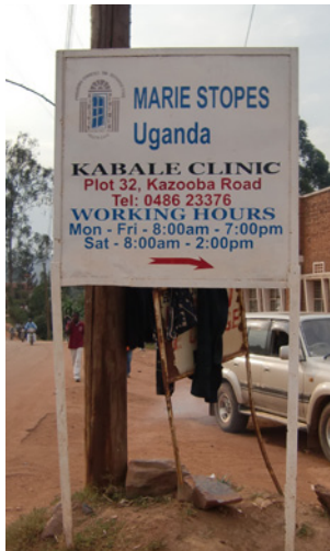
One of the many advertisements for Marie Stopes

“Officially, abortion is unlawful in Uganda, as in much of Africa. But there is a terrifying amount going on – in the villages, in clinics and the hospitals. Marie Stopes and other Western agencies like US Aid are hard at work.