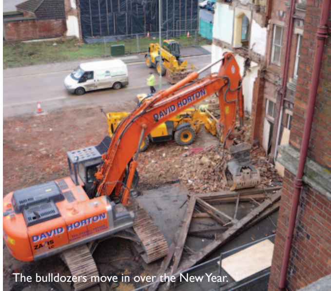
The bulldozers move in over the New Year.