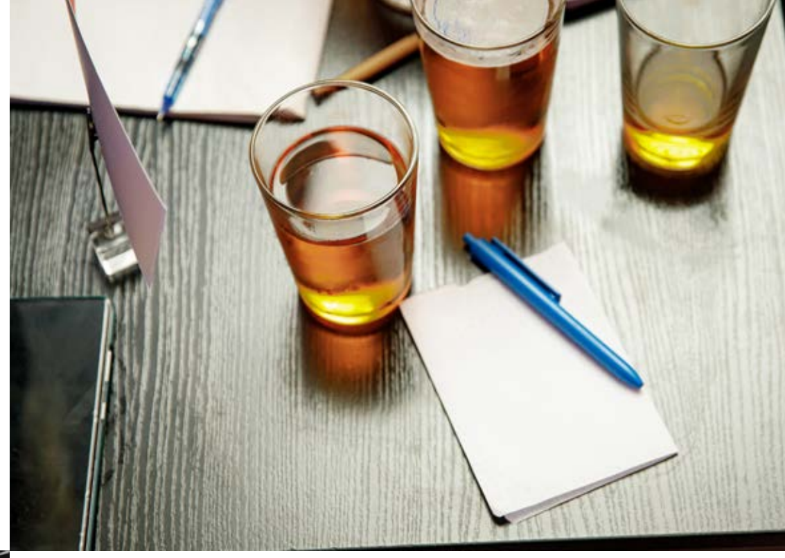
QUIZ – Challenge your friends and family to a quiz. Whether it's in your local pub, online or at home, there's no better feeling than being crowned the winner.